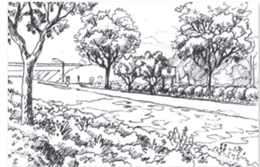
Sketch courtesy of Harumi Nakano

HBF and the Town of Hillsborough...Working Together