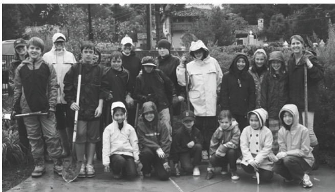
Daffodil Planting-Rain or Shine Every Fall